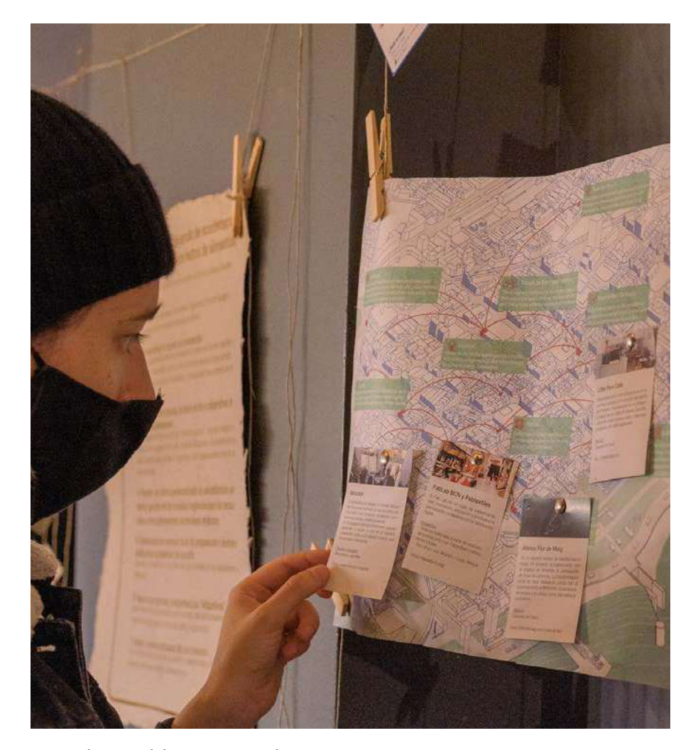
Remix El Barri Exhibition, Mapping the city.

In addition to designers and makers, Fab City OS has different kinds of users along the value chain of distributed production, such as small and medium enterprises, corporations, makerspaces, public administration, hobbyists and tinkerers, innovators, fab labs, even public waste departments, or e-commerce stores. The end-customer's user experience does not differ from any existing product purchase on an e-commerce store. And, they can be assured that their purchase was manufactured locally, supporting their local economy and lessening their global impact.